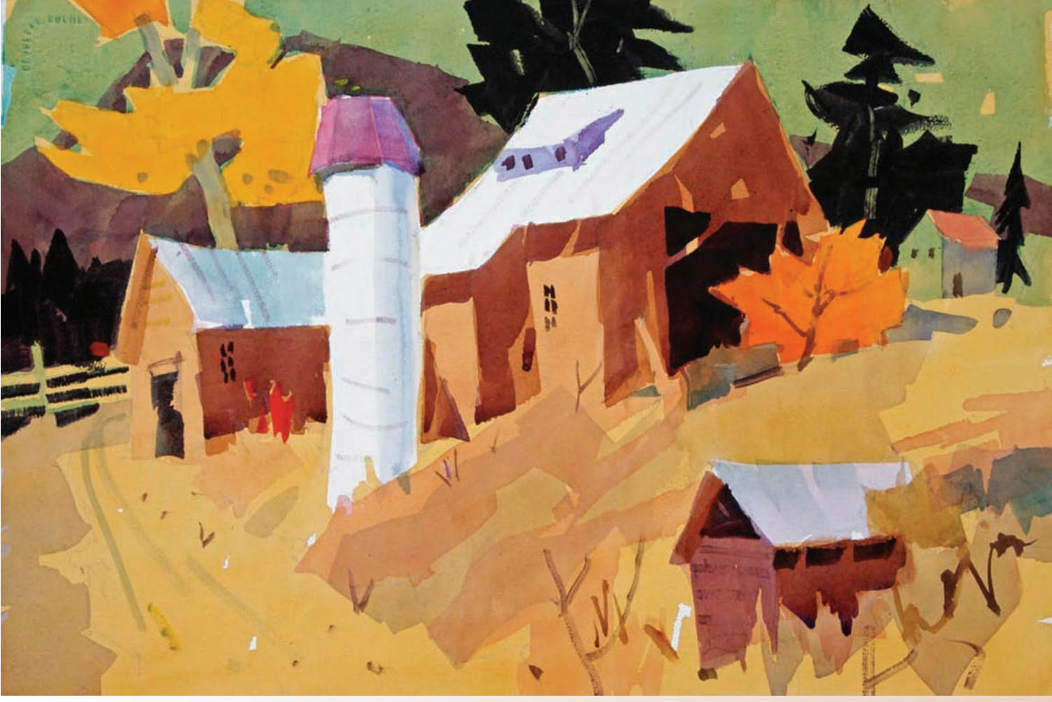
Above: "Steadman Farm