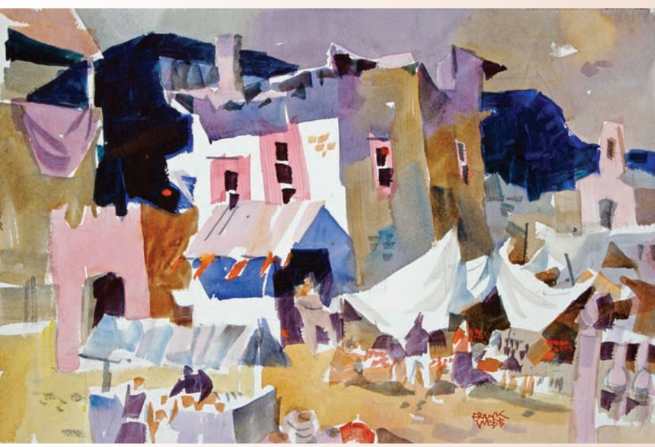
Below Right: "Zocalo in Taxco, Mexico"